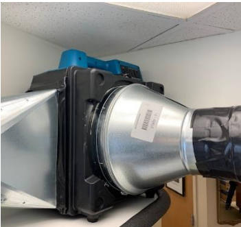
The above picture is the system Dr. Weiss installed that contains a dual HEPA filter.

We understand that the COVID-19 virus is not gone and we all need to be responsible and mindful until a vaccine is available. We will be calling patients today to schedule, but please call the office if you need an appointment.